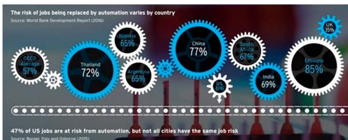
Figure 1. The risk of jobs being replaced by automation varies by country

These forecasts coincide with others –from Holmes & Osborne, 2013– in that the developing world will lose its comparative advantages as jobs are replaced by robots and 3D printing in next 20 years. 6 This is still not fully the case because of the abundance of cheap labour and because automation is still expensive in many aspects beyond the automotive and electronics sectors.