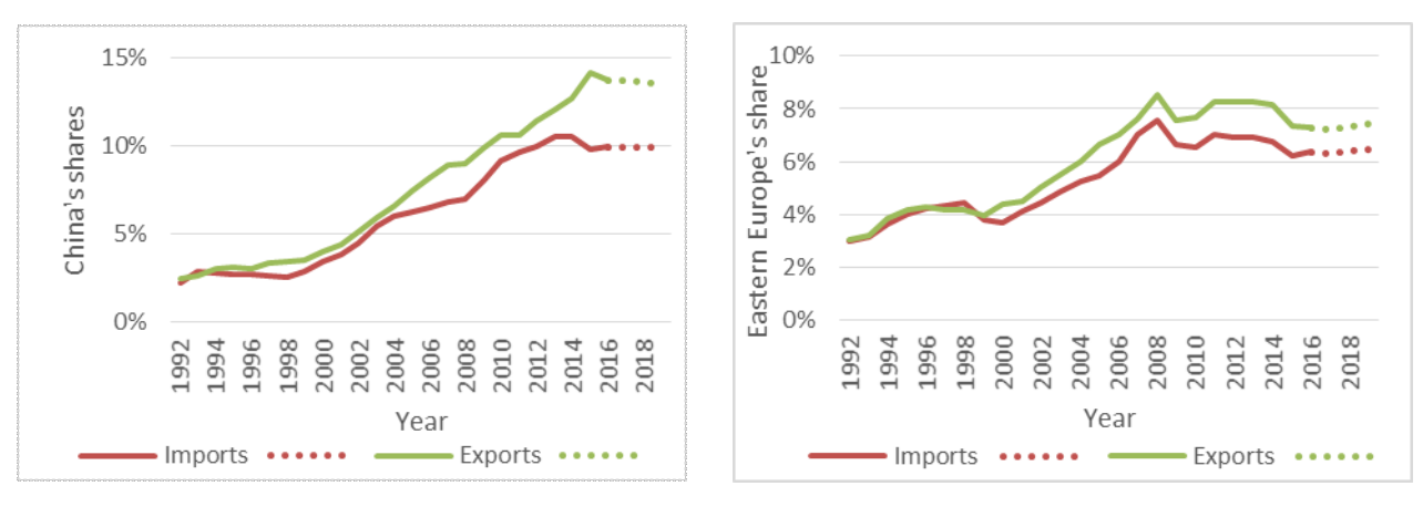
Figure 1. China and Eastern Europe<sup>4</sup> merchandise export and import shares of world merchandise trade (current US$)

Looking forward, it is conceivable that the high cost of adjusting to trade in the recent period is not representative. To be sure, there will be more trade and more trade shocks. For example, were India and the largest African countries to rapidly increase their participation in global manufacturing, this will add to the present dislocation. However, these possibilities look far off at present and the rapid rise of China and of Eastern Europe appear as unique events. With import penetration from China and Eastern Europe slowing sharply (Figure 1) and with trade barriers already low in the industrialized economies and in the largest developing ones (Figure 2), it is possible that the largest trade shocks are already behind us. In contrast, there appears to be little prospect of the adjustment to technology or domestic competition waning. If this reading is correct, it weakens the case for privileging trade in the mitigation of shocks.